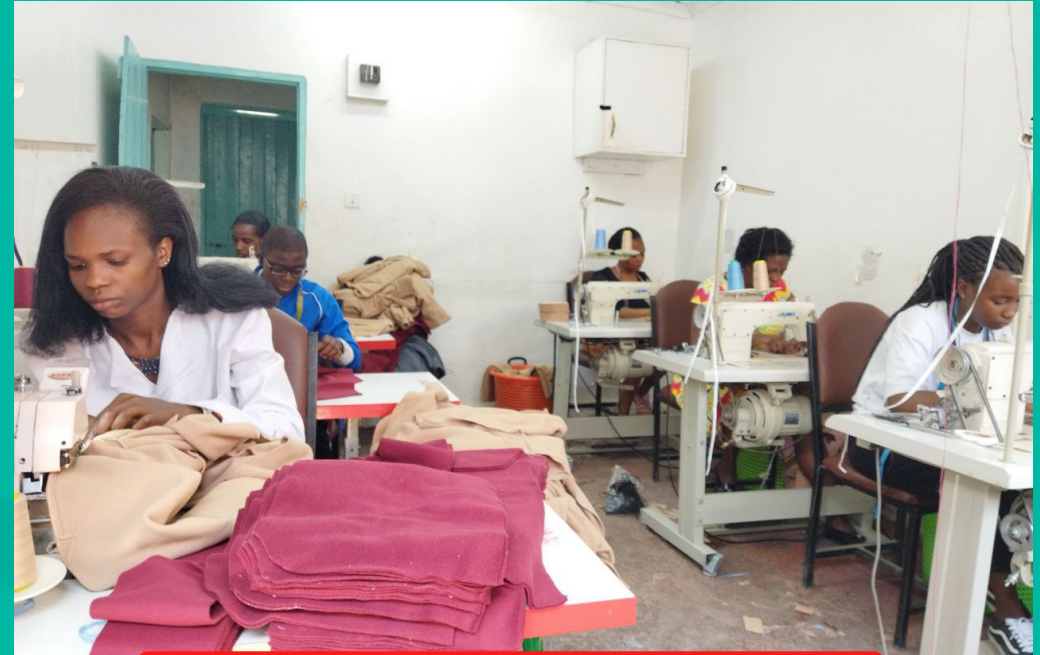
PRODUCTION TEAM WORKING ON UNIFORMS

We also intend to ensure that our employees are well paid and receive better welfare and remuneration packages compared to their contemporaries in similar start-ups. We occasionally benchmark with our major competitors to improve and solidify our business structure.