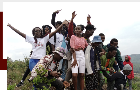
Mentees during a hiking experience