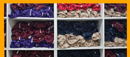
Section of the Daraja 360 Uniform Shop