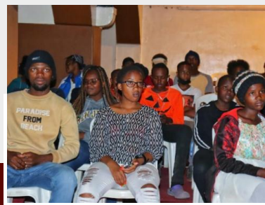
Mentees Watching a Play at Nakuru Players Theatre