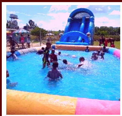
Mentees at Kunste Grounds for Swimming Activity