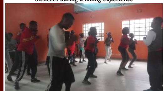
Mentees at Lifestyle Gym for physical exercise