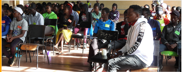
Campers keenly listening to a mentor talk