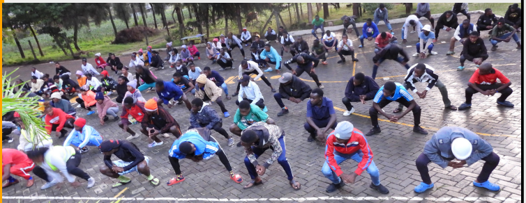
Campers during the morning aerobics & praiserobics session